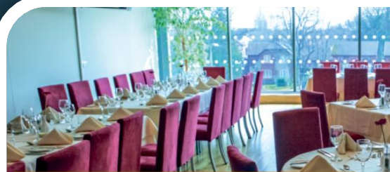
Aspire Restaurant & Bar